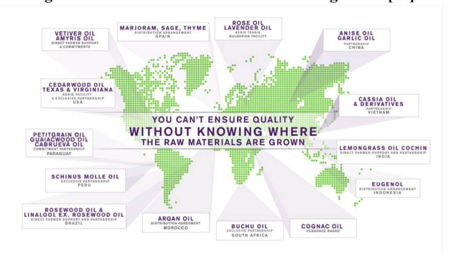
Figure 2: Location of raw materials for fragrances [14]

Hydroponic farming is more sustainable than traditional farming, and it is established that it can be used to restrict emissions and transportation costs in the beauty and fragrance industry. Most of the emissions in the agricultural industry come from extensive water use, land and soil degradation, pesticides, fertilizers, and CO2 from large scale tractors [9]. Figure 2 illustrates global areas which use agriculture to produce flowers for fragrances [14].