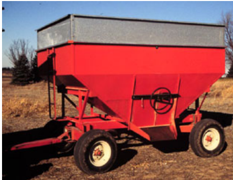
(Figure 7. Gravity wagon)

some victims as young as two years old. Normally, these children are not actively working, have a short attention span, and are unable to understand the hazards of flowing grain. These children should be in a safe play area and not in this hazardous work zone.