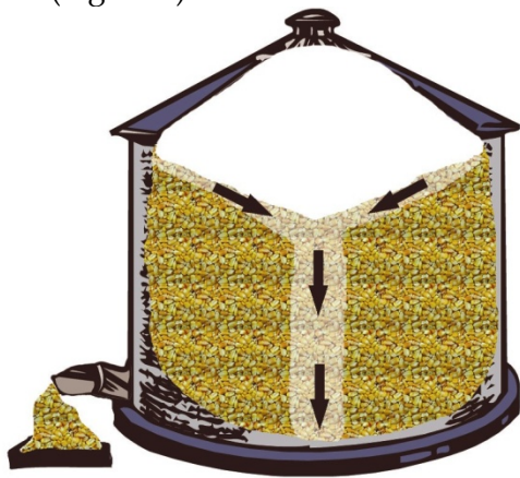
Figure 2. Normal flow from a grain bin

Flowing Grain: An auger is used to move the grain from the bottom center to the outer edge of the bin and into a vehicle or different storage. When the auger is running, grain flows out of the bin from directly over the outlet to the unloading auger in the center of the bin floor. This creates a funnel shape flow on the top of the grain with the grain flowing in a column below the surface, similar to the spout of a funnel (Figure 2).