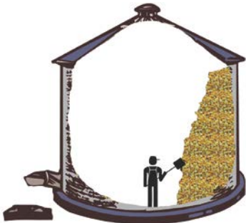
Figure 5. Avalanche of a grain wall.

Grain Wall Avalanche: In some cases, moldy grain will be found sticking to the walls of the bin. After removing the loose grain, the worker may be faced with a wall of crusted grain that must be broken free before it can be unloaded. If the wall of grain is higher than the height of the worker when the worker stands on the grain bin floor, an avalanche may occur as the worker tries to break up the crusted wall of grain. This avalanche could completely engulf the worker leading to injury and possible death (Figure 5). One foot of grain over an entire individual would weigh approximately 300 pounds. This is normally too much weight for the individual to break free.