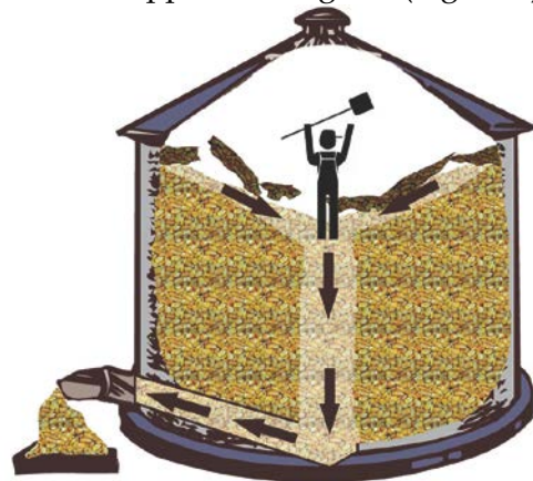
Figure 4. Collapsing grain bridge.

Collapsing Grain Bridge: A grain bridge can be a most inconspicuous entrapment hazard. Poorly conditioned grain can become moldy and harden into a crust-like mass. This can occur on the surface and anywhere in the grain. Cavities or pockets are created when dry or loose grain is unloaded by the auger and hardened or crusted grain does not move. This crust and the cavity below it is commonly referred to as a "grain bridge." This crust or grain bridge can give way if walked on while trying to break the crust. Breaking through the crust will cause the worker to fall and become entrapped in the grain (Figure 4).