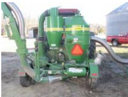
Figure 6. Grain vacuum

Grain vacuums (Figure 6) are used to rapidly move grain from older bins with smaller unloading augers, bins in remote locations without augers, and bins that have mechanical problems.