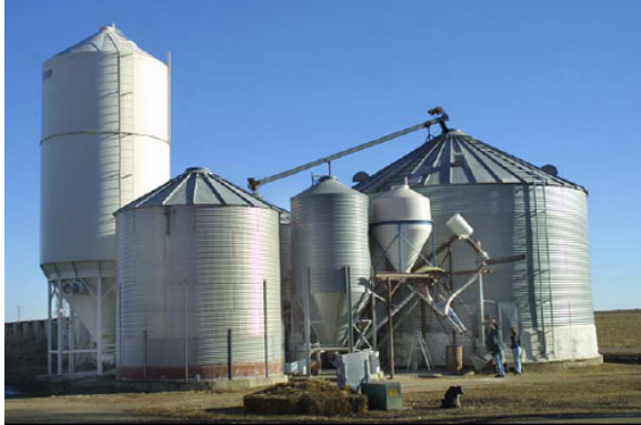
(Figure 1. Grain storage system)