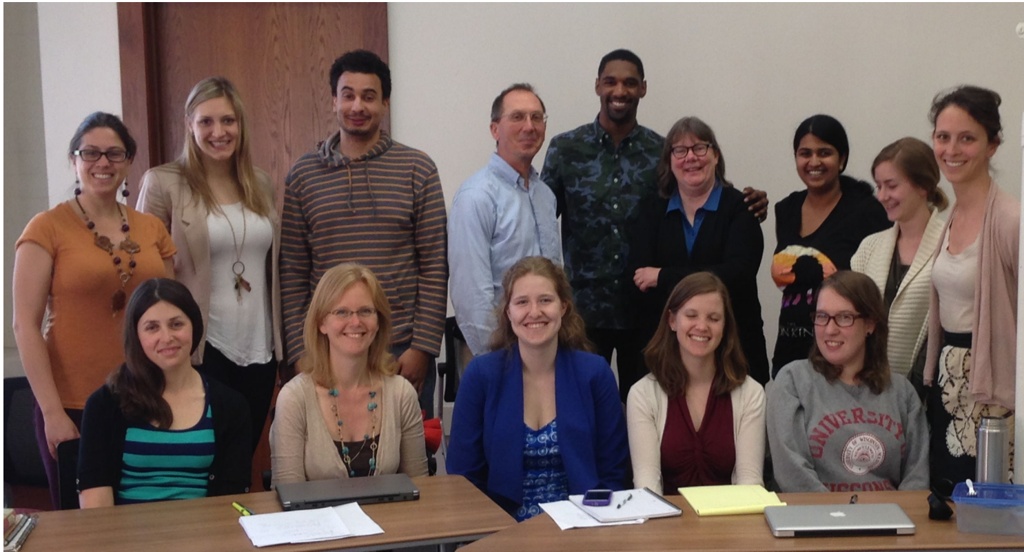
UW-Madison Milwaukee Area food system policy analysis team, Spring 2015