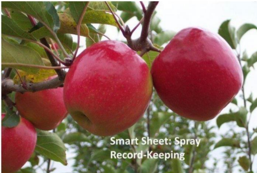
Smart Sheet: Spray Record-Keeping

#SMT-1008 | BE THE FIRST TO LEAVE A REVIEW