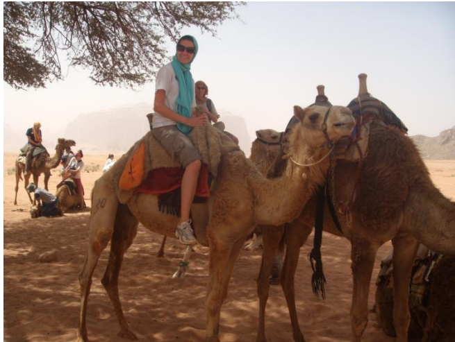
Me on a camel safari in the Wadi Rum

prominent family in Ajloun, where we had a traditional meal sitting on the floor.