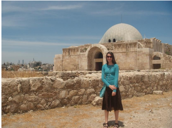
Me in Amman at the Citadel

This past May after a semester of studying ancient agricultural practices and how they evolved over the years, my Soils 497U class set off on the adventure of a lifetime. We flew nearly twelve hours before landing in Amman, Jordan, where we spent the next few days. Over the next three weeks, I saw so many different types of environments and ways of living that it was hard to believe we were exploring a country only the size of Indiana. From the crowded cities of Amman, to the ancient abandoned cities of Gerasa and Umm Qais, to the vast desert of the Wadi Rum, to the wetlands of Azraq, we saw everything. I felt that I learned a great deal about the history of the Middle East and ancient agriculture while comparing it to modern practices. We learned by actually meeting with farmers and local business owners, as well as higher officials in the Ministry of Agriculture.