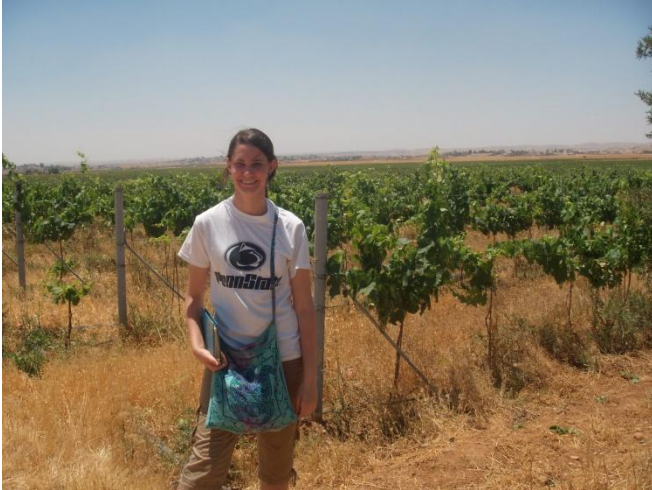
Me at the Vineyard

literally know everything! It was really cool to think that we were in one of the areas where agriculture first started and unbelievable to see how the landscape has changed. It seemed like many of the areas had once been lush farms but were now desert.