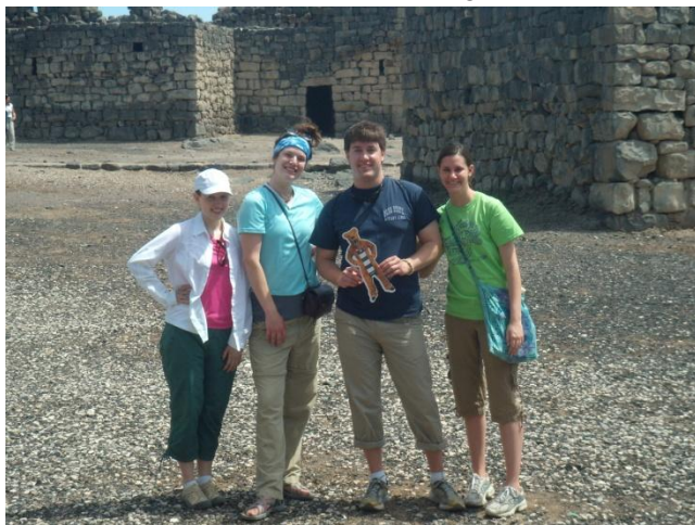
The Schreyer Scholars at a desert castle

While in Jordan, we studied ancient civilizations as one component of the class. We visited ancient Stone and Bronze Age cities, as well as areas conquered and developed by the Romans and later Christian Crusaders. We learned a great deal about Muslim and Christian history by visiting important