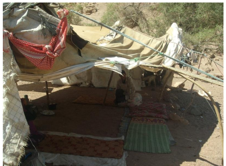
The Bedouin family we visited

Traveling the entire country, we got to see many different aspects of the society, from the city of Amman to the tents of the Bedouins. We visited the tent of a Bedouin family to learn about how they herd goats. We also visited the home of a