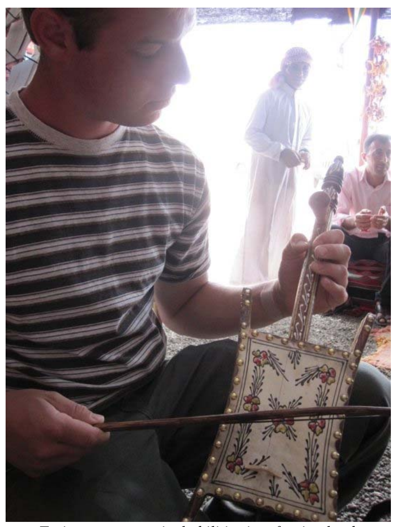
Trying out my musical abilities in a foreign land.

Of course recreation was part of the experience. We had the opportunity to float in the Dead Sea, take several hikes and off-road drives through the majestic wadis (valleys), take in the sites at Petra, and ride a camel. It is especially interesting to note that our diet the entire three weeks was much different than it would be in the Western world. We ate a lot of chicken, unleavened bread, hummus, cucumbers, tomatoes, figs, dates, olives, watermelon, cheese, yogurt, and some lamb.