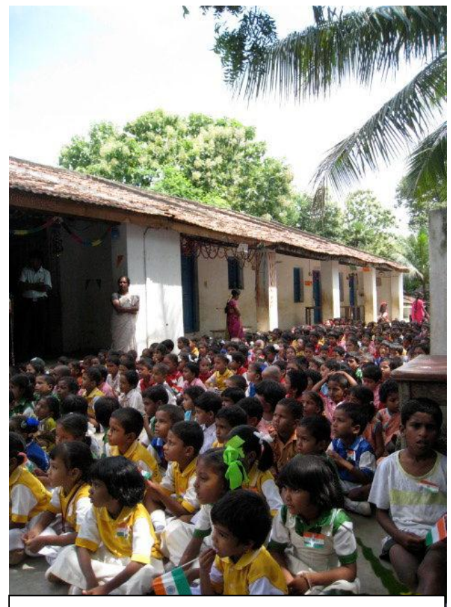
Children at school on Independence Day

Before this trip, I had never traveled outside the United States or been on an airplane, so every bit of the trip seemed extra thrilling. I will always remember our first bus ride once we left the airport in Visakhapatnam. To someone accustomed to American city life, I had difficulty comprehending the scene that I witnessed. Heaps of trash, open sewers, and sick beggars became commonplace sights. Buses, cars, trucks, auto rickshaws, bicycles,