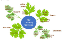
Fig 3. Activity branches that could be included in the PSU Latinx Ag Task Force