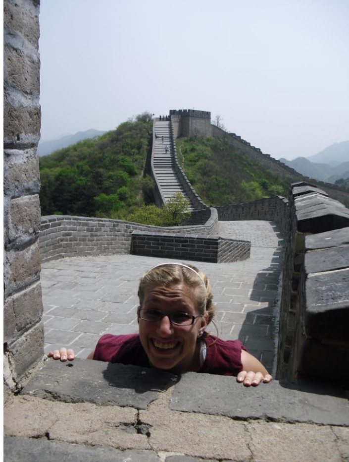
Me at the Great Wall