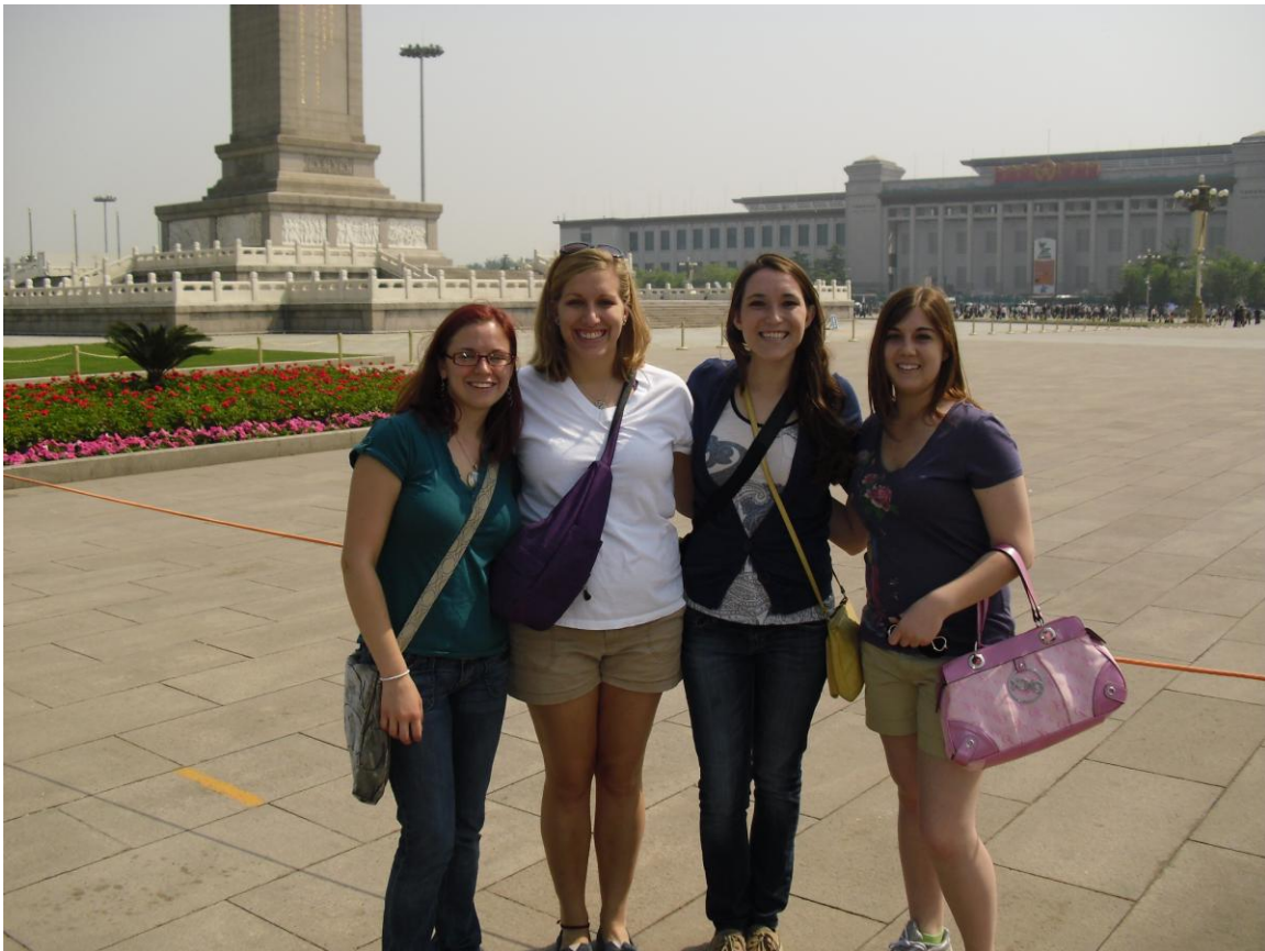
The group at Tiananmen Square