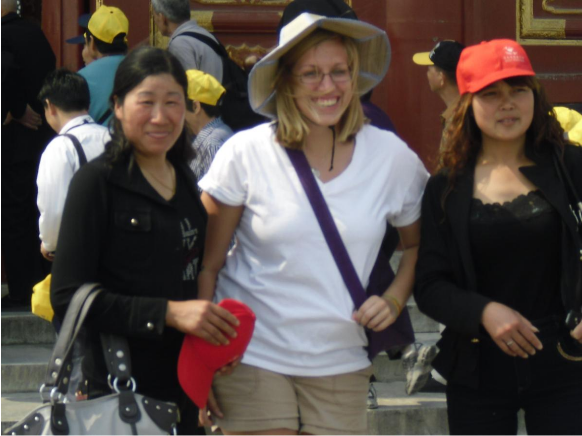
Me with some tourists at the Temple of Heaven