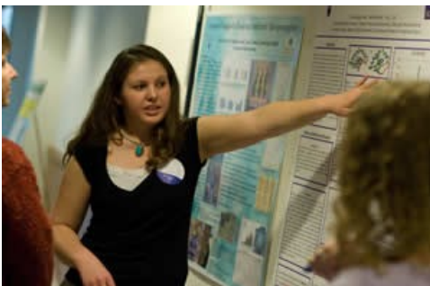
Above: A student explains her research poster at the 2008 GSD/CAS Research Expo.

The Gamma Sigma Delta/College of Agricultural Sciences Research Expo will be March 18-19, 2009, in the lobby of the Forest Resources Bldg. This annual expo provides both graduate and undergraduates with the opportunity to share their research with a larger audience -- those not in the same areas of professional interest. The Expo's purpose is to communicate the value of science to a general audience in terms that the public can understand, and to those in other areas of professional interest.